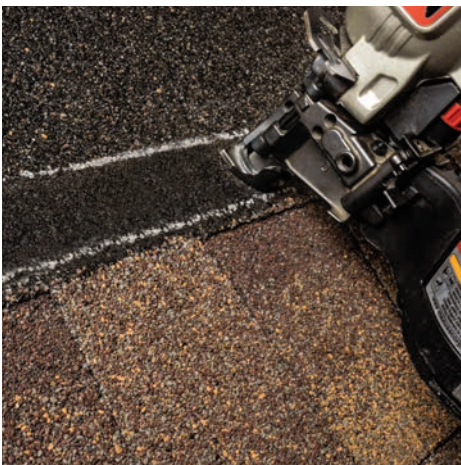
LayerLock™ Technology Powers the industry's widest nailing zone