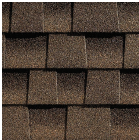
Beautiful finished look It's the same Timberline® Shingle you know and love, now even better